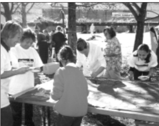
Get High on Life – community dot painting at the Drug Awareness and Information Expo on the Central Coast.