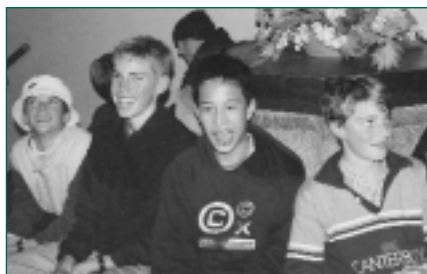
Young people at the Mudgee CDAT film night.

Our film screening of the movie 'Loser' attracted a further 200 young people and their parents and was a wonderful, informal way to introduce our team and to launch our writing and free expression competition which challenges young people to think through drug issues and present them in any format.