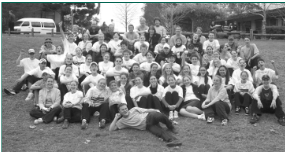
Young people making a difference – participants at the Joynt Youth Action Youth Drug Forum.

Joynt Youth Action is located in the Southern Highlands of NSW. Their aim is to create better opportunities for young people. In particular, the association focuses on youth drug and alcohol use and abuse in the context of broader youth issues. The Youth Drug forum was a major project for the CDAT taking 12 months to plan.