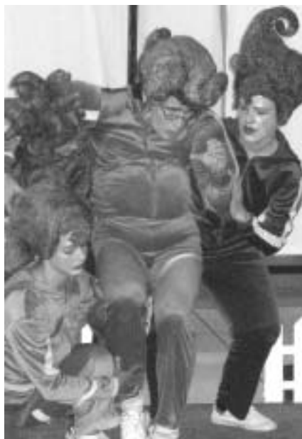
The Trackie Ducks give Dad a hand.

The show features the Trackie Duck family as they deal with various drug and alcohol issues. The production gives an idea about the pressures that can impact on families when they exclude someone and what happens when they support someone. Call NORPA on 6622 3279 for more information.