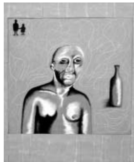
One of the entries in the 2003 Art Express – Drugs and Alcohol Exhibition.