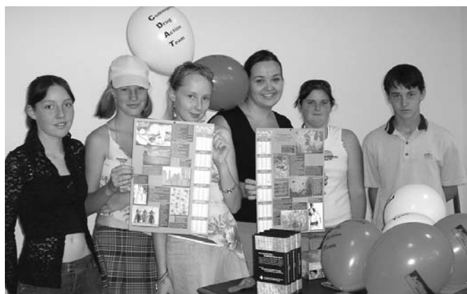
Proud of the calendar (photo courtesy of Eastern Riverina Chronicle).