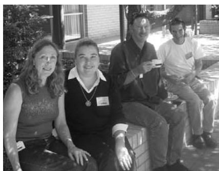
Participants of the Leeton conference.

Building Community Capacity Around Local Drug Issues – the Riverina/Murray Region CDAT Conference was held on 10-11 March 2005 in Yanco. Fifty people participated in the two day conference hosted by the Leeton Community Drug Action Team.