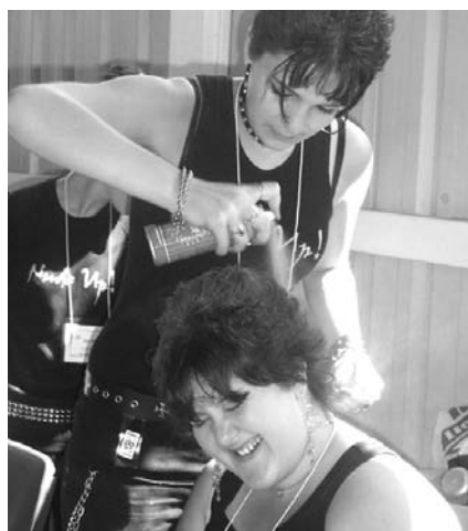
Trying out colour hair sprays.

Working with the youth services and council to run the events, Kyogle CDAT held a Natural High skate competition and a youth dance event.