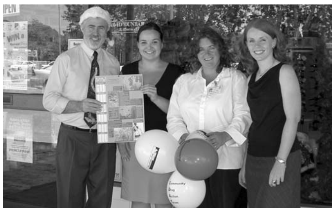
Calendar launch, 22 December 2004.

Residents were invited to provide written feedback outlining what they liked or disliked about the calendar and what they felt could improve future calendars. Positive responses clearly indicated the calendars were very popular and minimal changes were suggested.