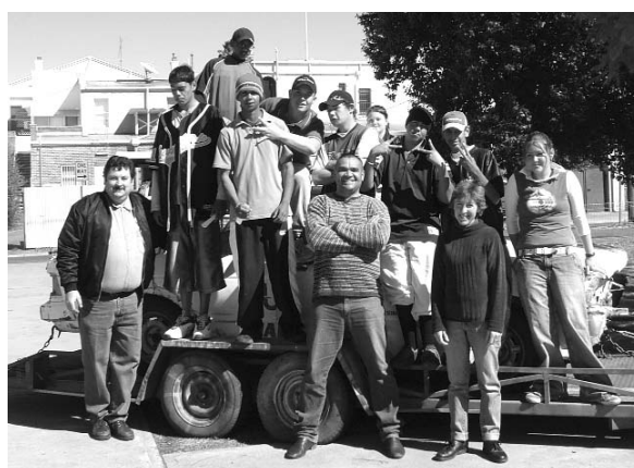
In the community spirit: The Narrabri Junior Speedway Project – Narrabri youth on the wagon.

The project, originally funded by NSW Premier's Department, caught the eye of NSW Police and Narrabri Shire Council, both of which also became joint funders, providing an opportunity for young people aged 14-16 to be involved in delivering a message. Other key partners include the Narrabri Community Drug Action Team, the Narrabri Youth Service, Narrabri TAFE, RTA, Narrabri Speedway Association, Best