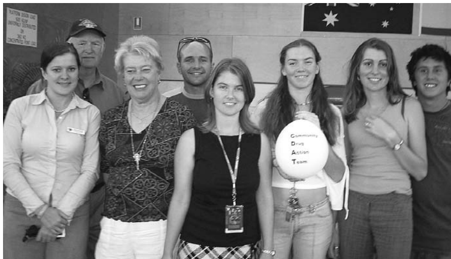
The Forster Tuncurry Community Drug Action Team.

Local young people were involved in developing the concept and acted in the production. New Moon Productions worked with the young people to develop the advertisement and organised local drug and alcohol free events such as the recent